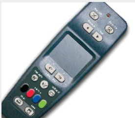
Intuitive Remote Control