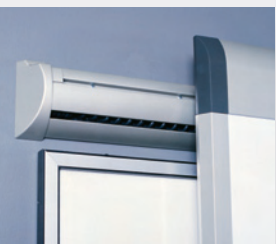
Power and Data Track *

* Walk-and-Talk board shown on Power and Data Track System over a Commercial Series Markerboard